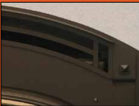
Mission Hill front detail

Doors are available in your choice of three trim options: black, satin nickel or gold.