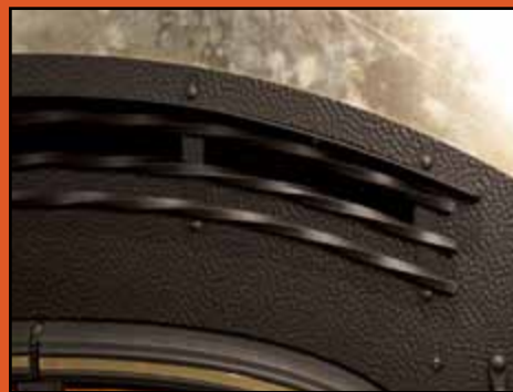
Valley Forge front detail