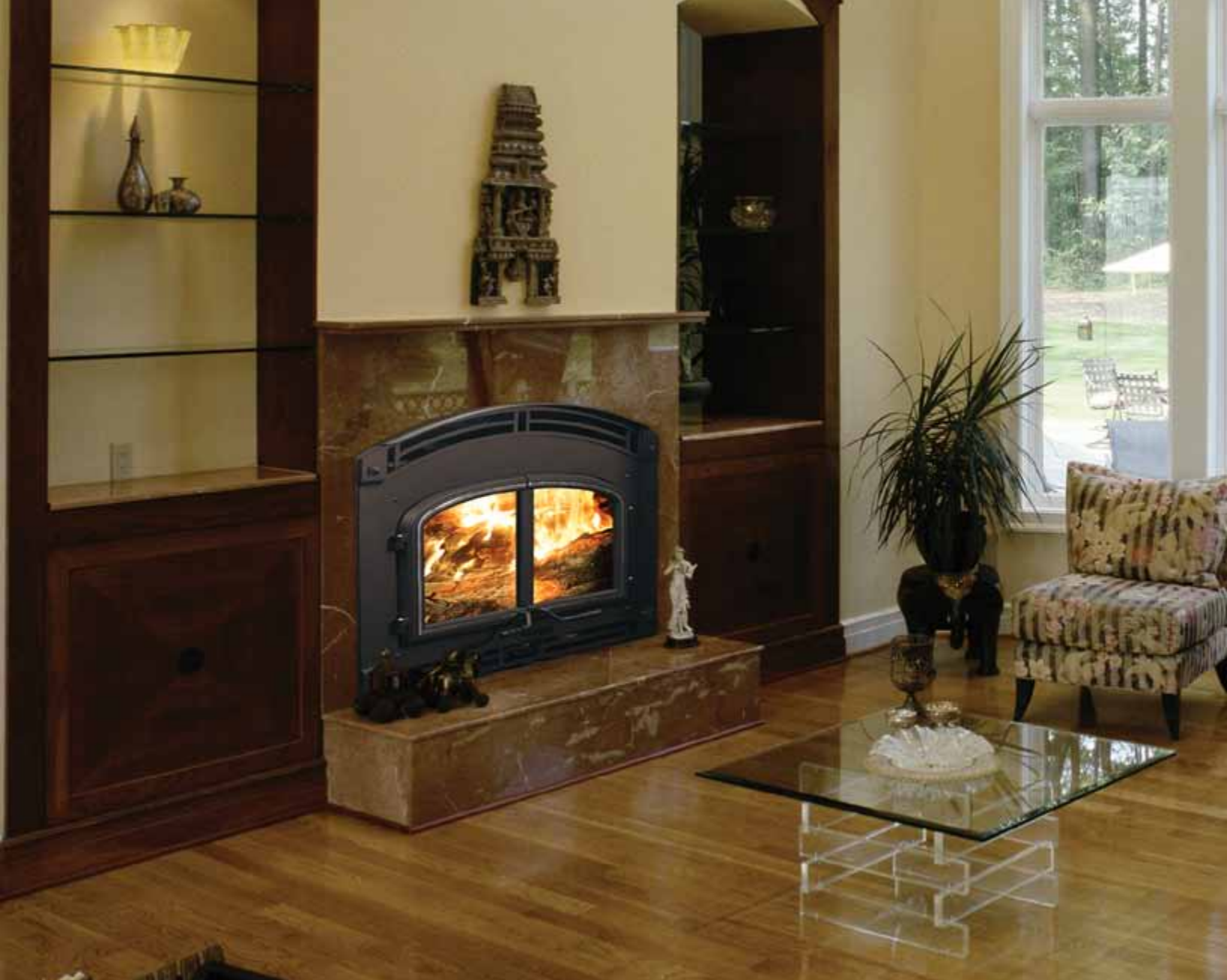
7100 with Mission Hill front and satin nickel trim door